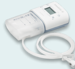
Invia® Motion Personal pump convenience with reusable pump performance