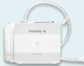
Invia® Liberty Therapy confidence made simple

Apria is the preferred national provider of Medela's Invia® negative pressure wound therapy products. Medela's Invia® NPWT System offers reusable and personal pump options: