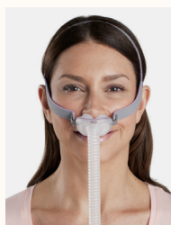
Nasal Pillow Mask