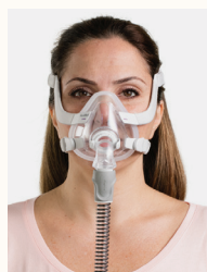
Full Face Mask